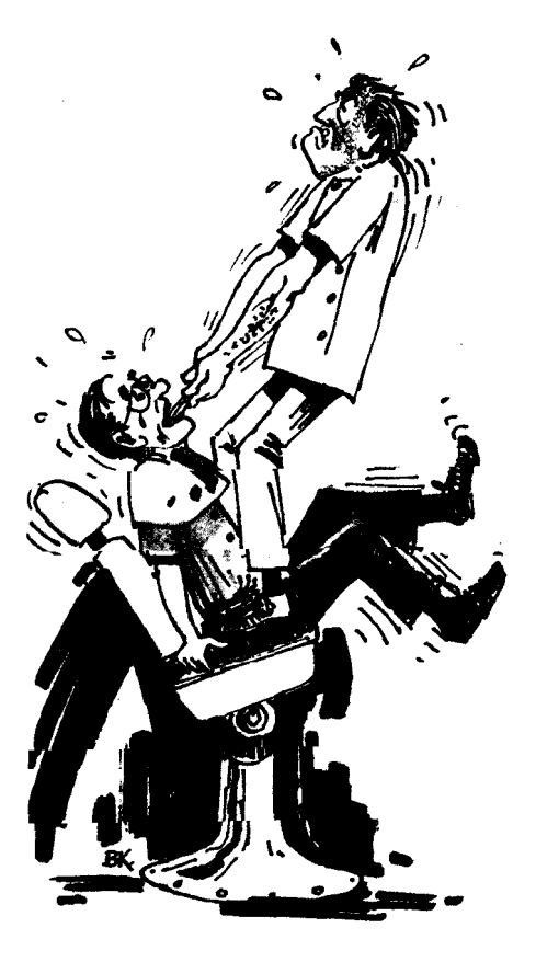
Oh, for the patience of a patient!

Triumphantly he pulled it out of my mouth and shoved its bloody, broken stump close to my face as he ruefully exclaimed, "Oh, one of the roots broke off!"